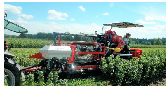
2 Columns Of Picking Head